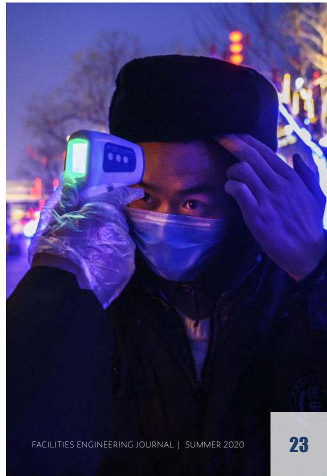
Figure C – Image from New York Times Article: 'Thermometer Guns' on Coronavirus Front Lines Are 'Notoriously Not Accurate'