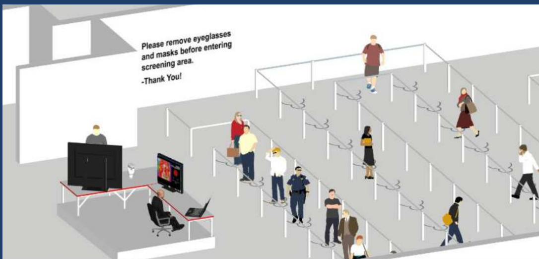
Figure B – 3-D Rendering of High Flow IR Fever Screening