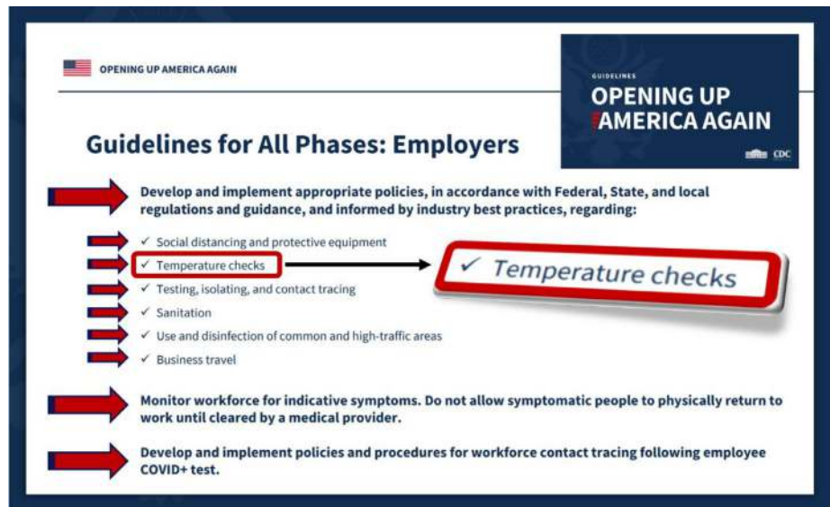
Figure A – Opening Up America Again Document Guidance for Employers

On April 16, 2020, the White House and Centers for Disease Control (CDC) came out with a document: “Opening up America Again” as guidance for citizens and businesses to get back to work (see Figure A). This is the main government guidance for companies, although other government agencies, insurance companies and attorneys are offering guidance as well.